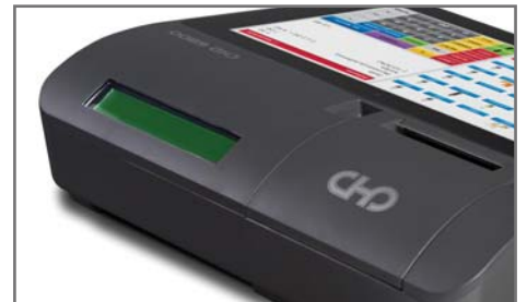
CUSTOMER DISPLAY, 240 x 48 dot